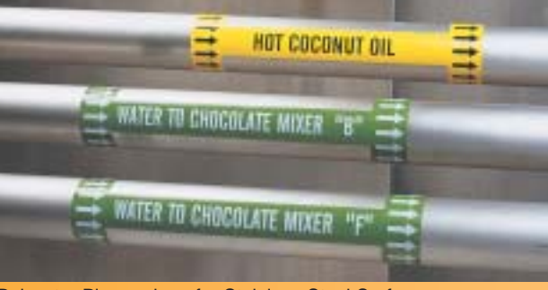
Polyester Pipemarkers for Stainless Steel Surfaces